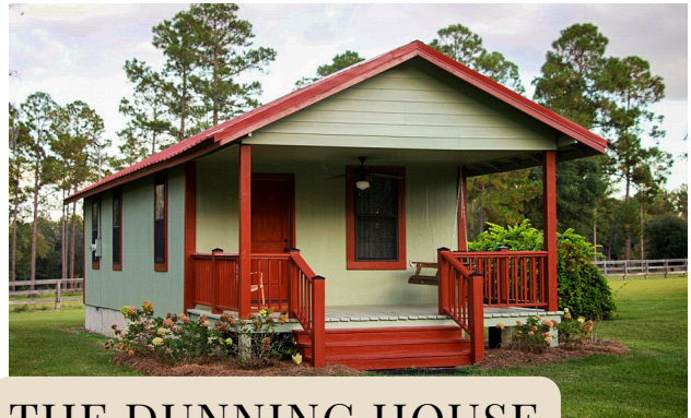
THE DUNNING HOUSE