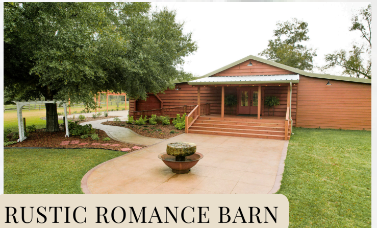
RUSTIC ROMANCE BARN