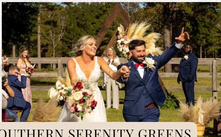
SOUTHERN SERENITY GREENS