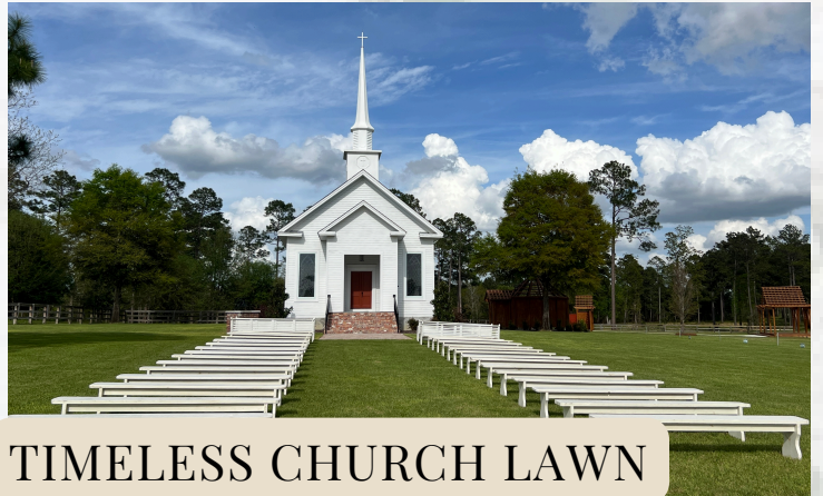
TIMELESS CHURCH LAWN